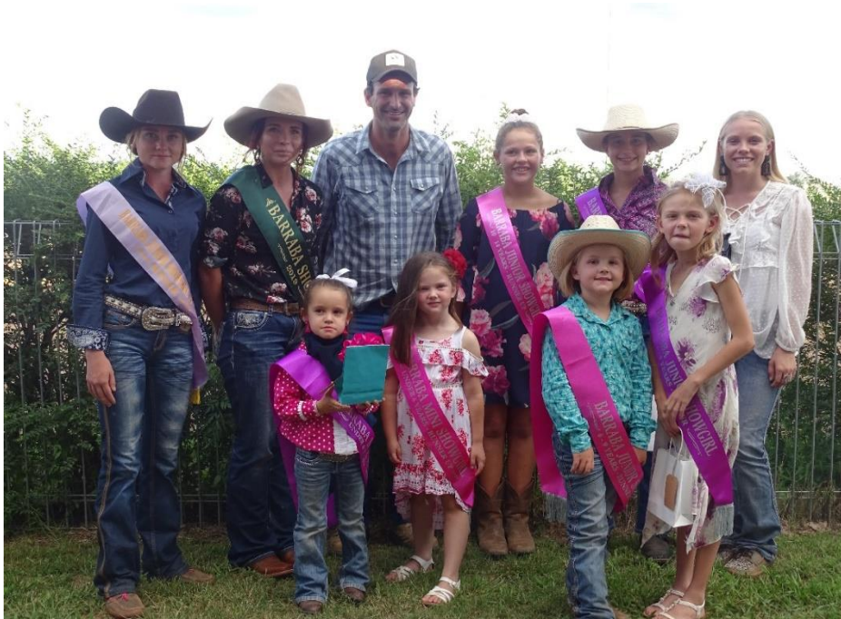
2020 Junior Showgirls & Judges

Girls/ Boys 5 and under are invited to enter as a mini showgirl/man. All girls/boys up to between 6 – 9yrs, 10 – 14yrs and 15 – 17yrs are invited to participate in the Junior Showgirl/Man competition in 2021. Entries for all age groups will be taken at the show office with the secretary or in front of the grandstand on the 6 th March 2021. Judging will take place at 4.00pm.